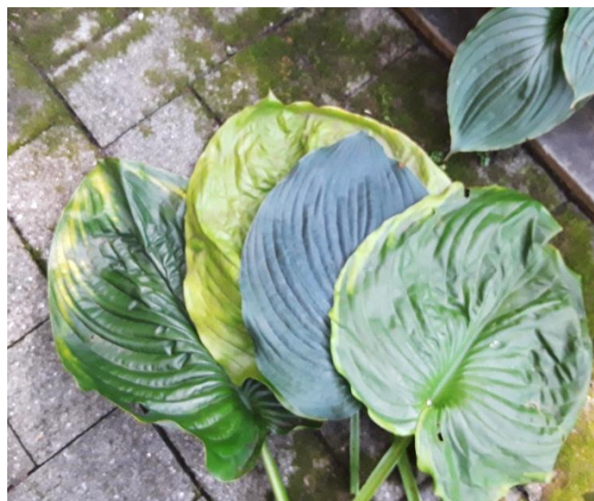
Big Leaves. The winners: 'Empress Wu' (a trifle sun bleached), 'Sum and Substance', 'Blue Angel', and the mystery variegated leaf.