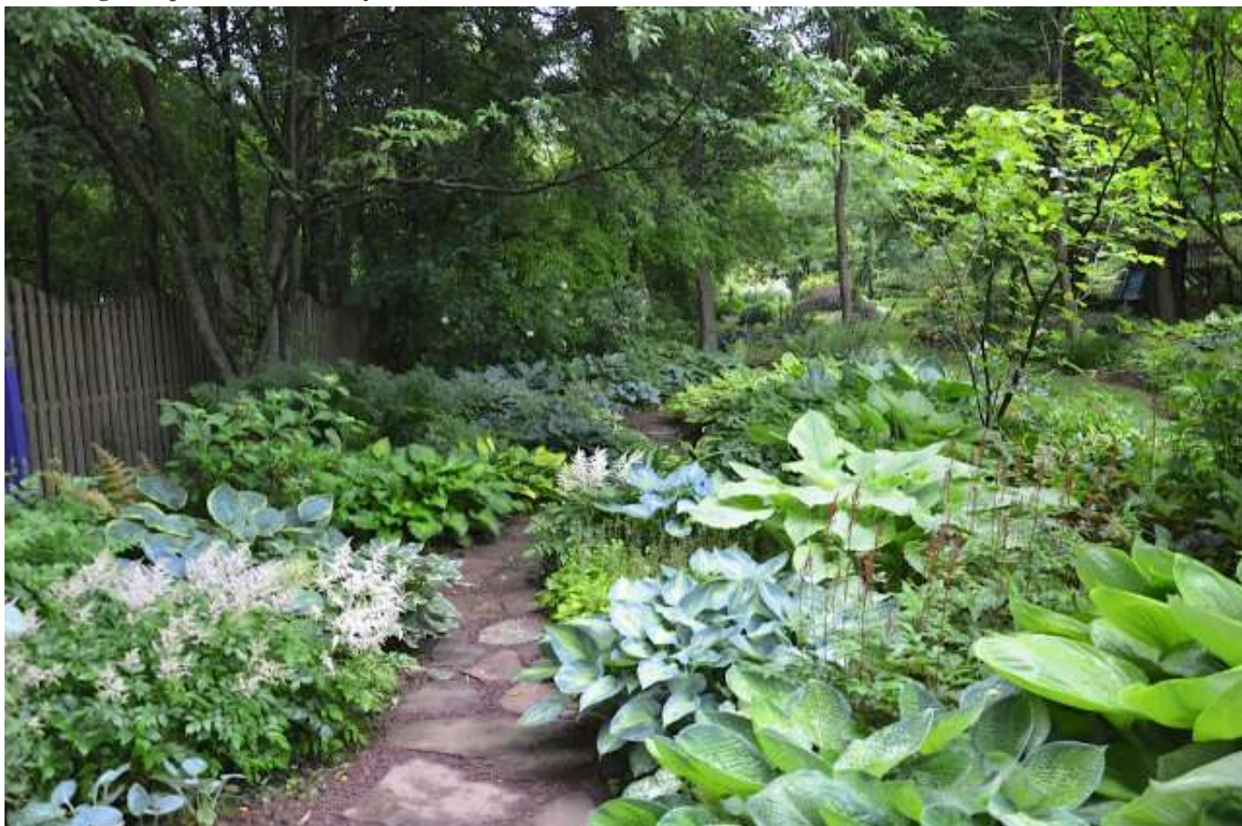
A gentle path along one side of Holly Lane Gardens.