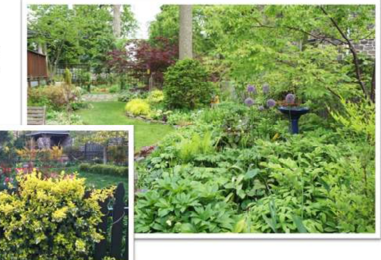
Something is always blooming because the "gardener" loves exuberant color.

including heuchera, dahlias, roses and special varieties of unusual plants, many arriving as a sharing from other gardeners.