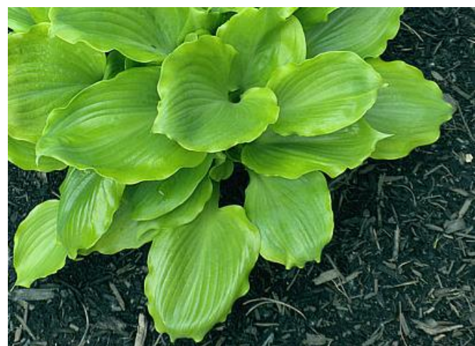
H. 'Lodestar' (sport of S&S).