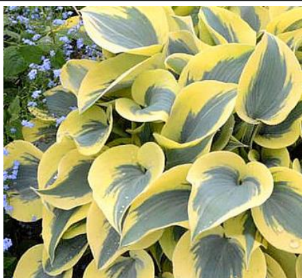
H. 'Autumn Frost' Walters Gardens 2009 PP23224

Medium sport of H. 'First Frost' Wider, more yellow margins