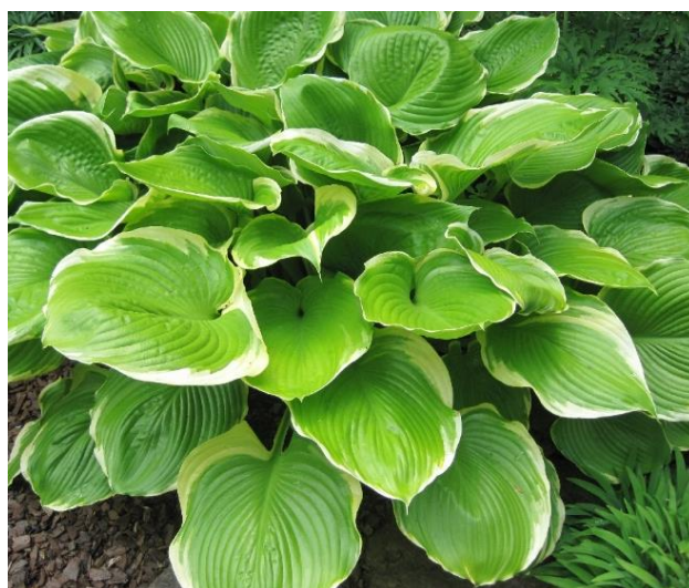
H. 'Winter Snow' (sport of S&S) in the Parsons' garden. Photo: