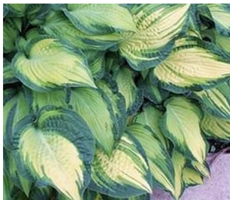
H. 'Happy Dayz' 2014 Naylor Creek