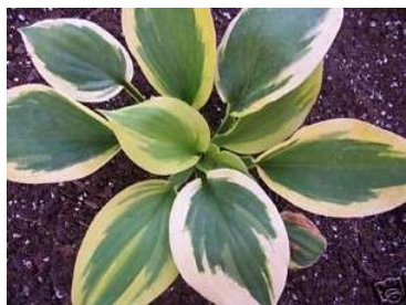
Summer Lovin — $20

(Q & Z Nursery 2004) (Sport of 'Summer Breeze') Medium, 18x36" or larger. This hosta has a strange attraction for me, it has a certain glow about it. The rich gold margins contrast well with the almost round, dark green centers of leaves that have substance and shine. Lavender flowers appear in July. As attractive in spring as it is in summer.