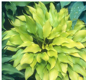
Tongue Twister — $15

This bright yellow harbinger of spring has arrowhead-shaped leaves with good substance but it is the closed orchid flowers that persist for weeks in mid-summer on perfectly proportioned yellow scapes that make this a very unique hosta. It is a very sturdy little plant that grows very well.